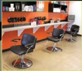
Salon Work Stations