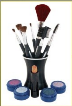
Makeup Brushes & Lipstick