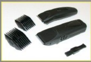
Hair Clippers & Accessories