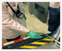
Cradle Release Bar