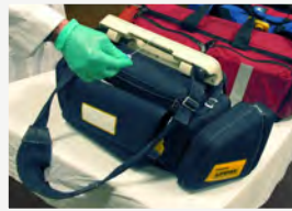
Cardiac Monitor Handle